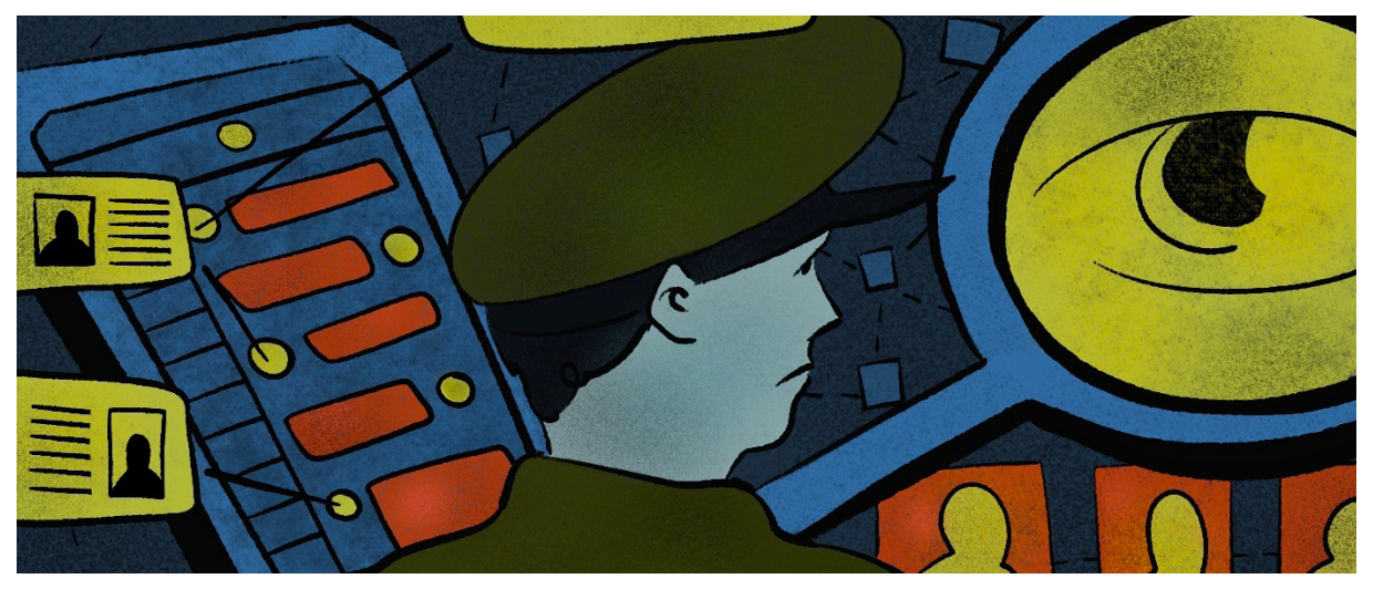
Illustration Boris Khmelniy / Mediazona

Consequently, the state fails to uphold its obligations to ensure free media operation without censorship or restrictions in exchanging information between media and information sources <sup>19</sup>. Media labeled as "extremist formations" face restrictions in interactions, including accessing essential information for timely event coverage and receiving financial or other support, particularly in Belarus.