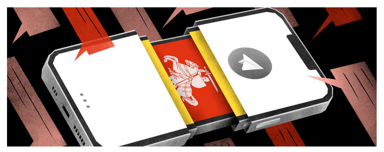
Illustration Mary Tolstova / Mediazona

In the first half of 2023 alone, about 700 materials <u>were declared</u> "extremist". From July to September 2023, resources from at least ten media outlets <u>were added</u> to the "extremist materials" list. Mirror websites of online media, accounts on all social networks, and any public pages are blocked based on the detection of "signs of extremism" in separateindividual materials, completely cutting off access to the media and its products. The possibility of such extensive persecution is the result of the legal regulation and arbitrary law enforcement practices described below.