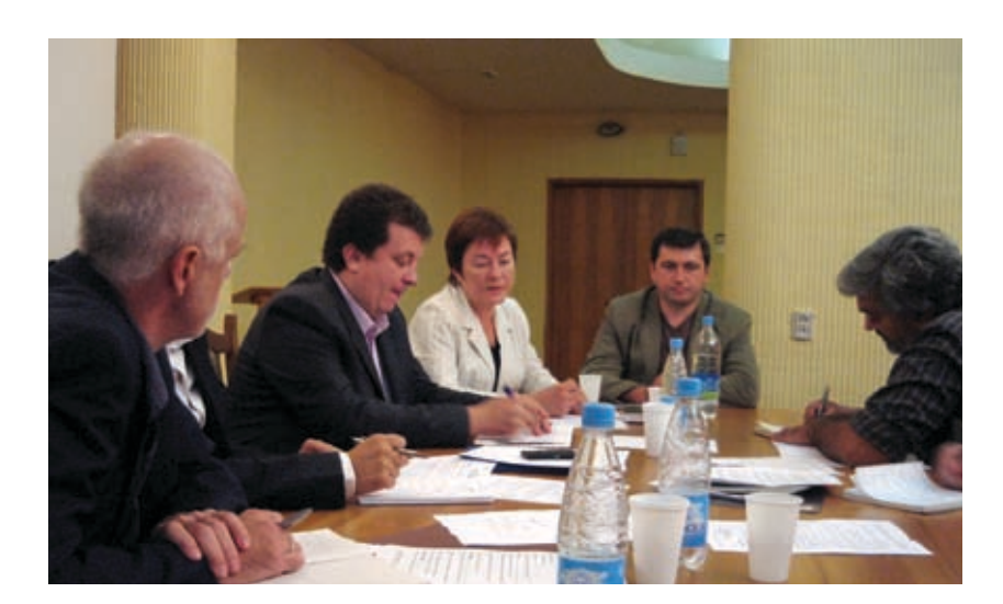
BAJ top leaders in meeting with the International Media Mission to Belarus, September 2009.

According to the Federation of Trade Unions of Belarus, 94.1% of the economically active population of the country is affiliated to a trade union and the working relations of 97% of workers in enterprises, organisations and other institutions are regulated by means of collective agreements.