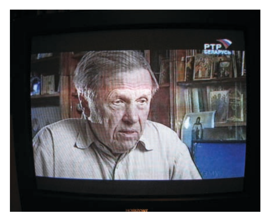
State-controlled TV channel in Belarus.

According to the above mentioned decrees and regulations the Commission (which is the sole and only regulator of both, the broadcasting sector and the process of the allocation of licences and frequencies) is founded not by the law adopted by the Parliament, but by the decree of the Council of Ministers. The latter together with the Ministry of Information appoints all the members of the Commission, including the chairman, who ex officio is the Minister of Information. Thus the Council of Ministers and the Ministry of Information are in full control of the process of allocation of all frequencies and licences. Decrees and regulation does not contain the reference to the inclusion of civil