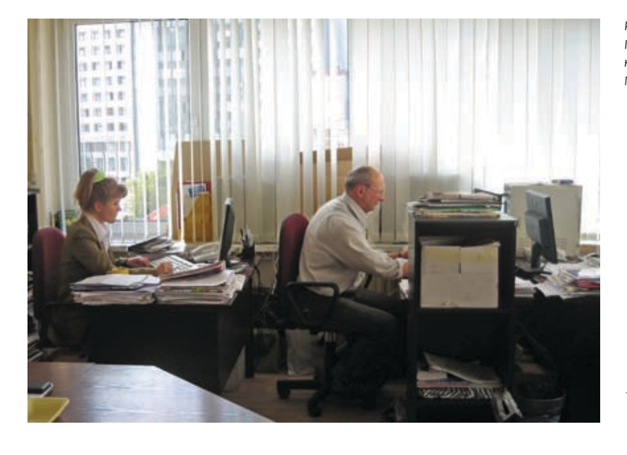
Journalists at work at the newspaper Belarusians and Market in Minsk.

Chapter 9 of the law outlines the liability of media for violating media legislation. The first step is a written warning to editors, which can be based on a number of reasons including "disseminating inaccurate information that might cause harm to state and public interests" and "distribution of information not complying with reality and defaming the honour or business reputation of individuals or the business reputation of legal entities" (Article 49, paragraph 1). Following this, the Ministry of Information can suspend the operations of media for three months for a number of reasons, including for failing to provide information on remedying offences with the necessary evidence (Article 50 paragraph 1). The last sanction that can be applied is for a court to terminate the activities of a media outlet (Article 51), including that the founders of that media would be restricted from starting a new outlet for three years (Article 10 paragraph 3.3)<sup>20</sup>.