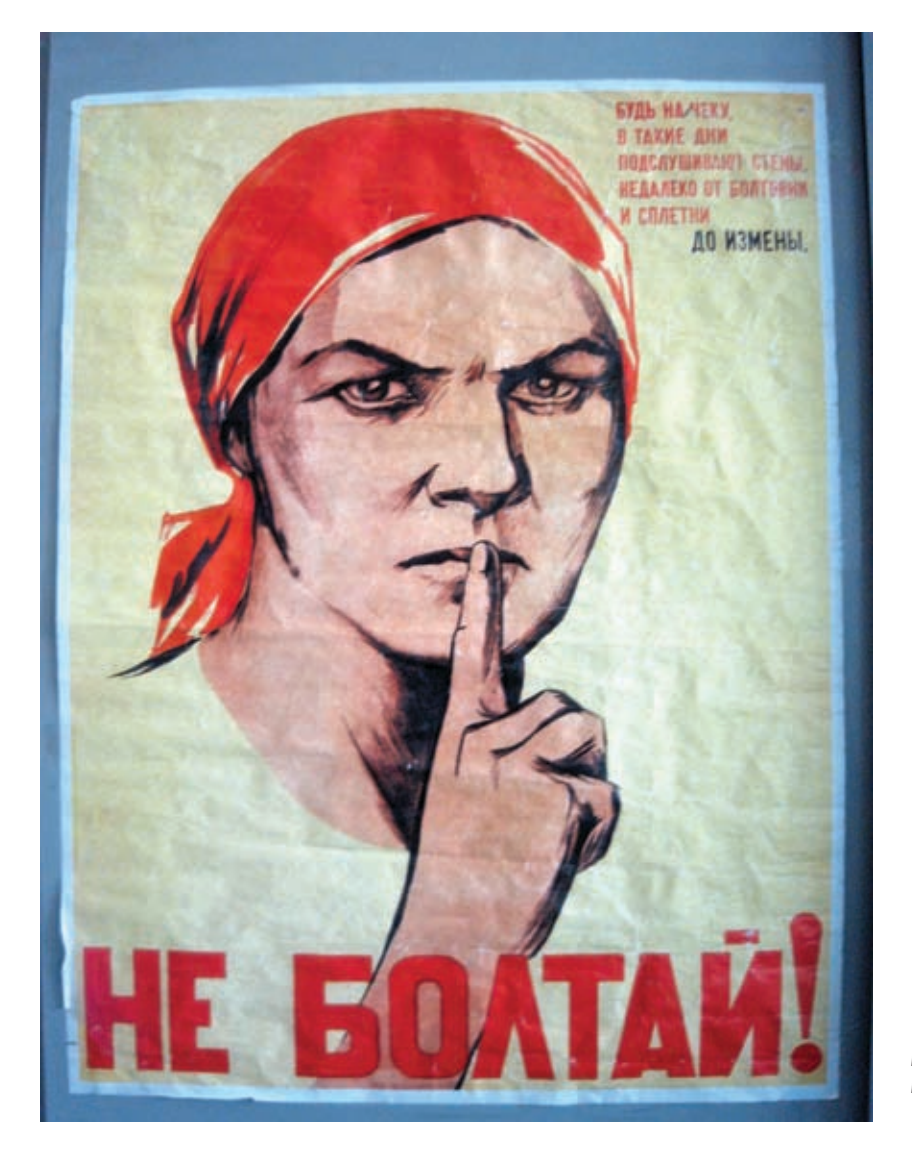
Poster cautioning "Don't tell!" in Russian.

On 15 July 2008, amendments to the Law "On state service in the Republic of Belarus" were adopted. In particular, the law was complemented by Article 22-1, according to which all statements to the press of officials at any level, should be authorised by the chief of their state institution or by a person authorised by the chief.