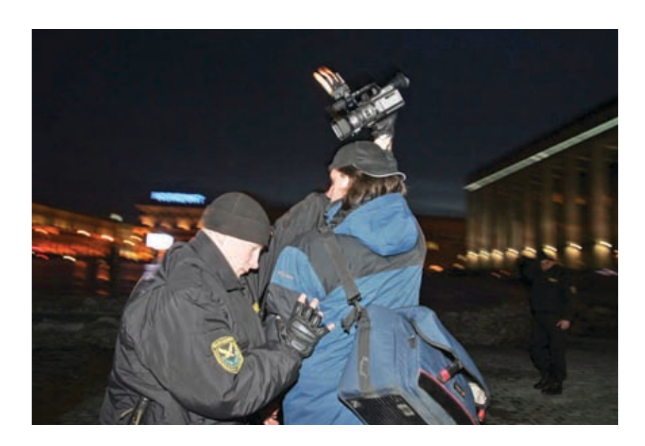
A special police officer tries to prevent a TV cameraman from filming a street action of protest after the presidential elections of 2006.

When the Belarus government engages with the media, it routinely uses the language of war. Speaking at the Belarusian State University in February 2008 President Lukashenko clearly stated that he considers sectors of the media beyond his direct authority a direct threat. "Media hold a weapon of a most destructive power," Lukashenko told a group of journalism students at the university, "They must be controlled by the state."