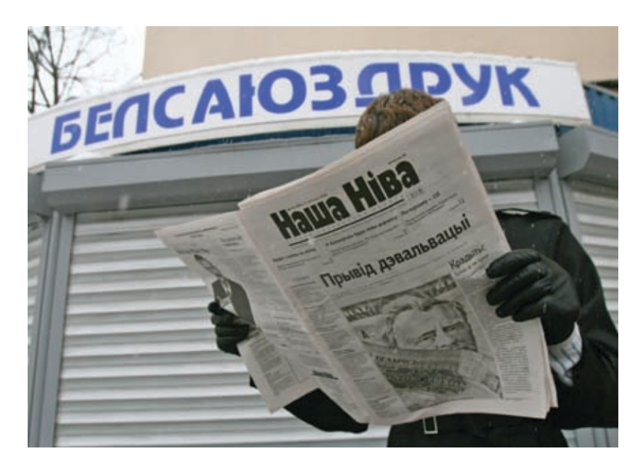
On 4 December 2008 the independent newspaper Nasha Niva was brought back to Sayuzdruk state system of press distribution after several years of being out of it.

Traditionally, there are two ways of press distribution in Belarus – subscription and retail sales through a system of newsstands (kiosks). There are two major state enterprises that deal with those. Sayuzdruk is a nation-wide system of retail press distribution (kiosks). Belposhta (Belarusian Post) is a national post service enterprise that owns a press subscription system.