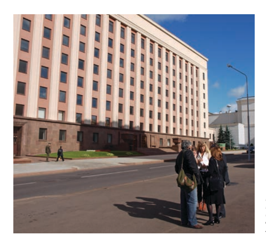
International Media mission in front of the Presidential Administration in Minsk.

Based on the knowledge and expertise of the participating organisations in reference to international media standards, the purpose of the mission was to undertake an assessment of the present media environment and freedom of expression situation in Belarus. In the same light, the purpose of the present report is to ensure that press freedom and media reform remain at the heart of the on-going negotiations between the European Union (EU) and the Belarusian government – both in regard to the current suspension of certain EU sanctions against Belarus, the longer term Eastern Partnership Initiative and the Human Rights Dialogue (elaborated on below). A first meeting between some of the organisations of the mission and the Direction General E, Directorate Western Balkans, Eastern Europe and Central Asia, Council of the European Union , was held in Brussels on 1 April 2009. Subsequently, updates on the media situation in Belarus were sent to the European Council by the group of organisations involved.<sup>2</sup>